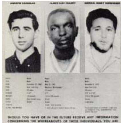
Andrew Goodman (20), James Chaney (21), and Michael Schwerner (24). These three civil rights workers were among the many who risked their lives and were murdered registering voters in the South during Freedom Summer in 1964.

Although many view this percentage as positive, given the years of pain and suffering endured by our relatives who built this Country, fought its wars and raised its children, we as African Americans, collectively, should be more than ashamed. One-third of eligible African-American voters not voting is unacceptable.